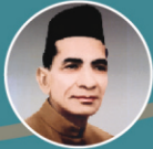
Sir Shri Ram

(1884-1963)-Founder, The Shri Ram Group Carrying the legacy of its Group Founder, Sir Shri Ram (1884-1963)-who was instrumental in setting up premium educational institutions such as the Shri Ram College of Commerce (SRCC) and Lady Shri Ram College for Women (LSR).